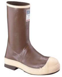
ST 22114 EH Copper / Tan 12 in. WP » Meets ASTM F2413-18 » Men's whole sizes: 4-15