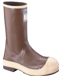
ST 22148 EH Copper / Tan 12 in. WP » Meets ASTM F2413-18 M/I/C EH » Men's whole sizes: 6-13