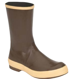
PT 22115 EH Copper / Tan 12 in. WP » Meets ASTM F2892-18 M EH » Men's whole sizes: 4-14