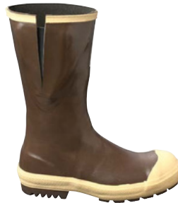
ST 22234 EH Copper / Tan 15 in. WP » Gusseted for calf flexibility » Meets ASTM F2413-18 M/I/C EH » Men's whole sizes: 3-15