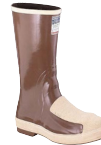
ST 22206 EH Copper / Tan 15 in. WP » Duraguard® metatarsal impact protection MT » Meets ASTM F2413-1 M/I/C EH Mt » Men's whole sizes: 5-15