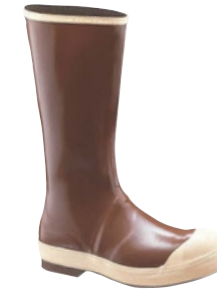
ST 22214 EH Copper / Tan 15 in. WP » Meets ASTM F2413-18 M/I/C EH » Men's whole sizes: 3-15

The open channels "squee-gee" liquids, fats and debris out with each step to help prevent slips and falls.